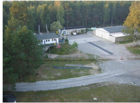
Clubhouse, hangars and sanitary facilities